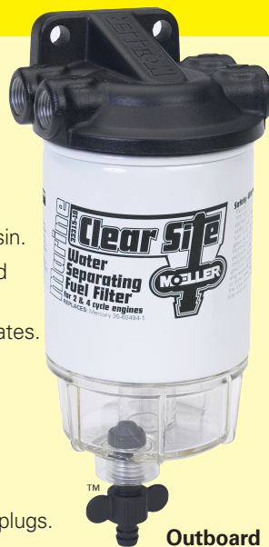
Outboard Part No. 033314-10

WARNING • Outboard engine use only! • Not for use with diesel fuel!